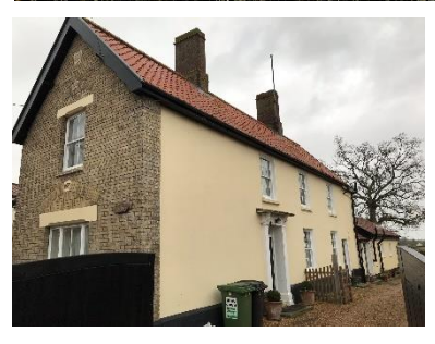
DICKLEBURGH AND RUSHALL NEIGHBOURHOOD PLAN REGULATION 14 PRE-SUBMISSION