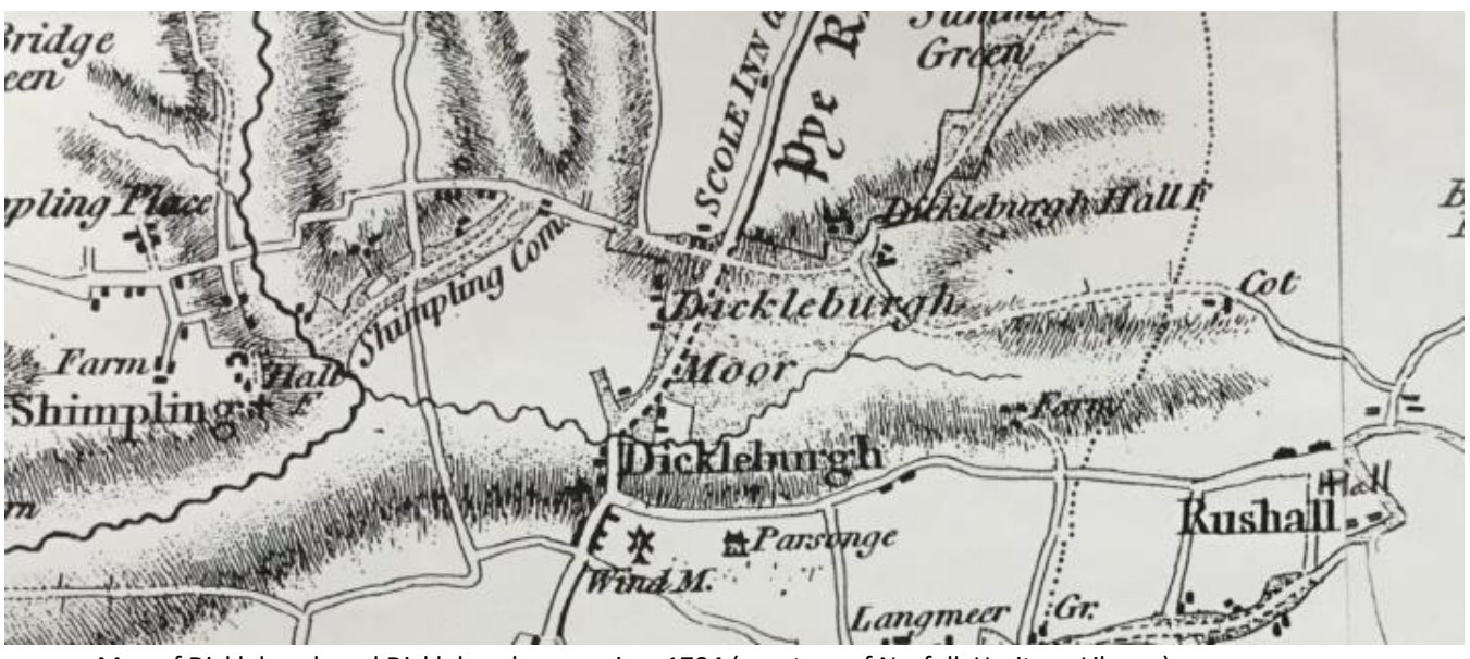
Map of Dickleburgh and Dickleburgh moor circa 1794

Retaining open vistas of and access to the Moor is a principal concern to the population of the Parish and one that is considered of paramount importance to protect.